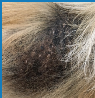
Figure 1. Day one of feeding BLUE Natural Veterinary Diet HF shows presenting lumbar alopecia.