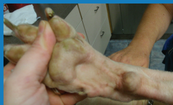
Day 14 Figure 4. Interdigital dermatitis already improved after two weeks.

HISTORY: Patient exhibited chronic allergic dermatitis since 6 months of age, with recurring secondary pyoderma. Skin scraping was negative; allergen testing showed responses to environmental allergies, including trees, grasses, and molds.