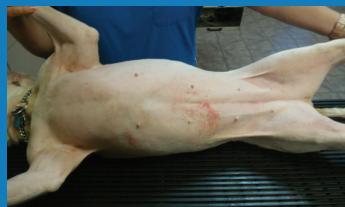
Day 14 Figure 3. Two weeks after feeding BLUE Natural Veterinary Diet HF Hydrolyzed for Food Intolerance, there is marked improvement in dermatitis.