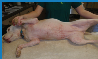
Day 1 Figure 1. Day one shows diffuse ventral erythema, pyoderma, and pustules.

Signalment: Baby Ray, an 8-year-old Pit Bull, spayed female dog